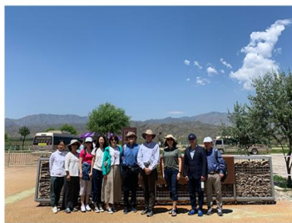
Western Xia mausoleum